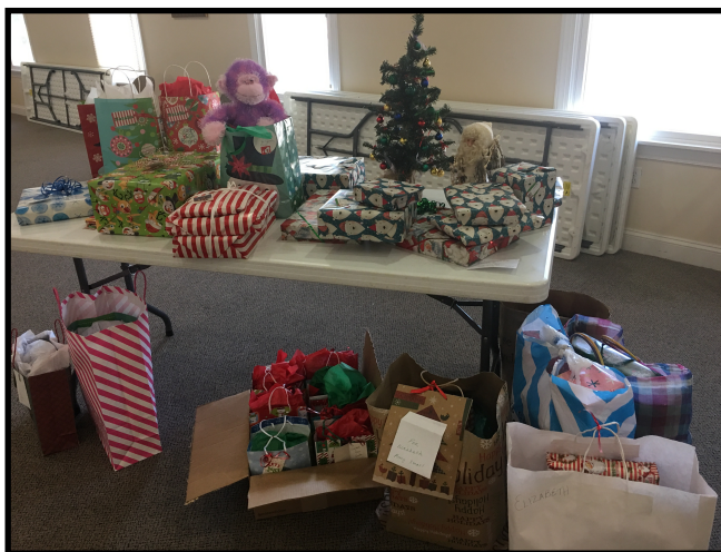
Ladies of the Circle gave generously to a local family with 5 children.