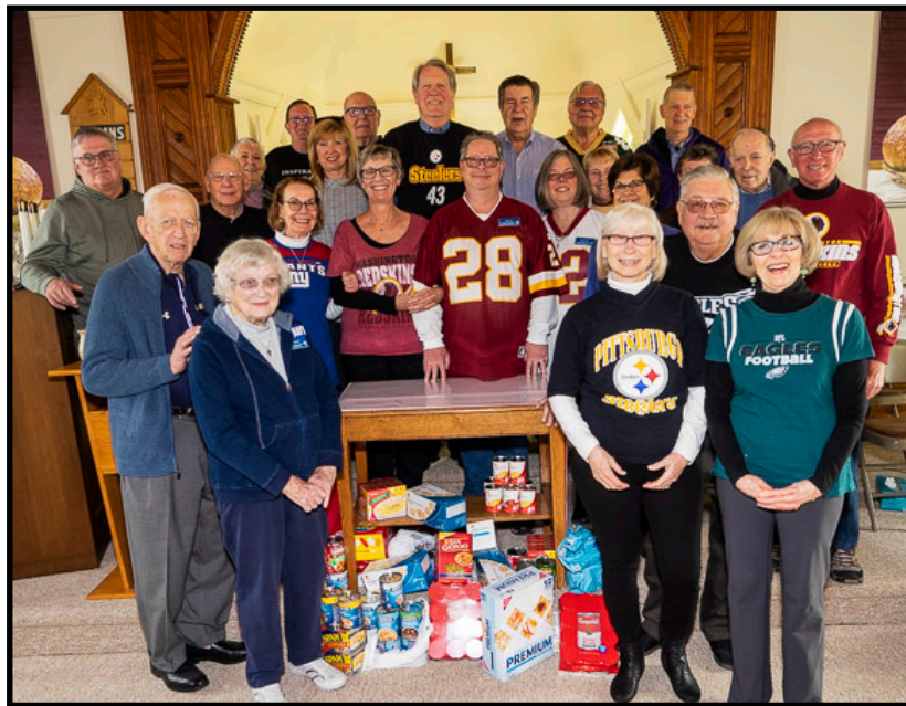
Souper Bowl Sunday collected food for the Pyle Center