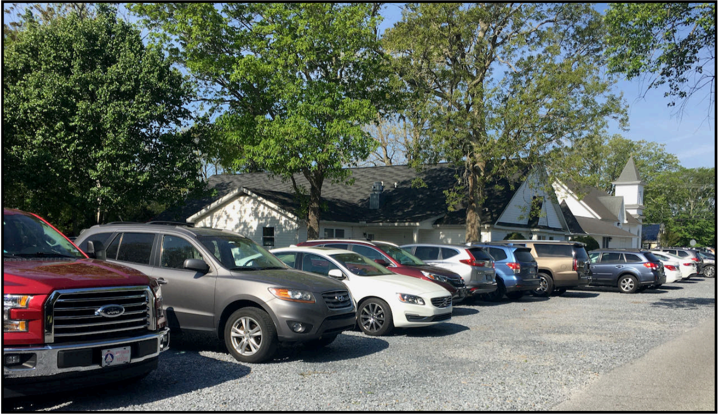
Back to IN PERSON church.

OCEAN VIEW PRESBYTERIAN CHURCH 67 Central Ave Ocean View, DE 19970